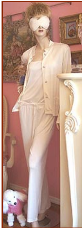
Milk Fiber Jacket and Pants